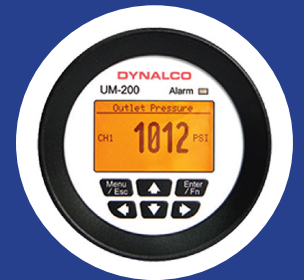
UM-200 2- Channel Universal Monitor