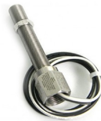
M319 Passive Magnetic Pickup Hazardous Area