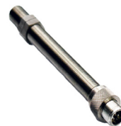
M919 Hall-Effect Magnetic Pickup