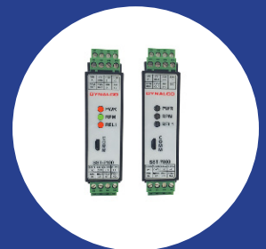
SST-7000 Digital Speed Switch & Transmitter