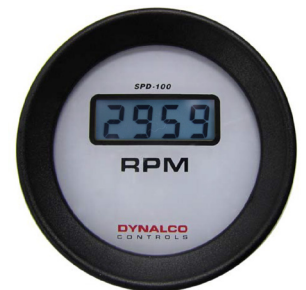
SPD-100 Digital Tachometer