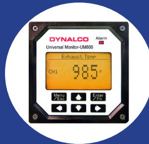
UM-600 6- Channel Universal Monitor