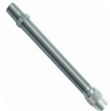
M204-6 High Sensitivity Magnetic Pickup