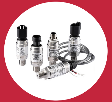
BoT Pressure Transducers