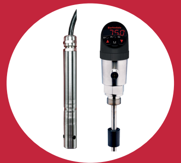
Level Transducers & Gauges